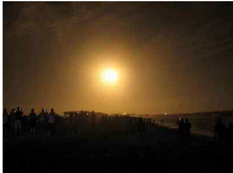
DG Jim & Tina on Cocoa Beach watching launch of Heidi's space shuttle